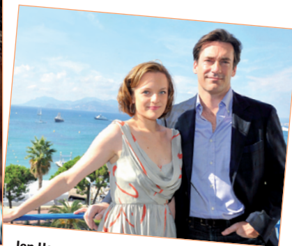
Jon Hamm and Elisabeth Moss